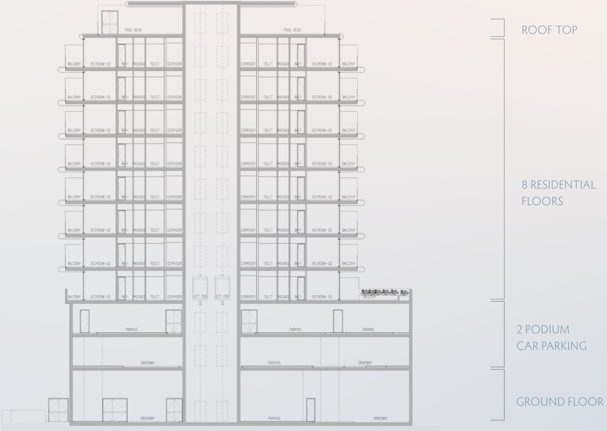
G + 2 PODIUM CAR PARKING + 8 RESIDENTIAL FLOORS + RF RESIDENTIAL