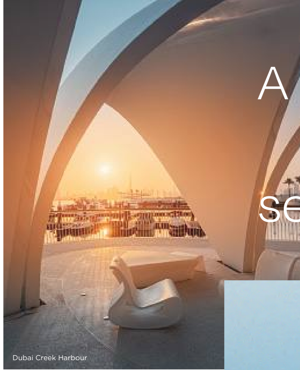
Dubai Creek Harbour